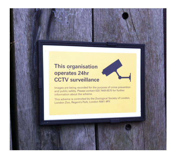
Figure 1: CCTV warning sign outside London Zoo, image courtesy of Chris Campbell.