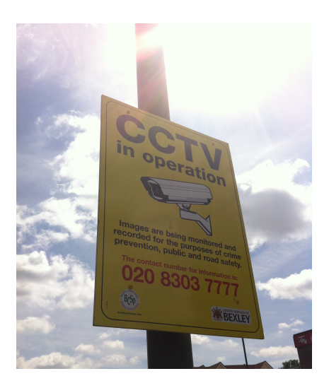
Figure 3: CCTV warning sign in Bexley, London, image courtesy of Chris Campbell.

The sign in the second image contains the warning: "CCTV in Operation. Images are being monitored and recorded for the purposes of crime prevention, public and road safety". Other typical noticications are "24hr CCTV – Images are being recorded and monitored for your safety and to help prevent crime" or, more frequently in semi-public or privately owned spaces such as shops, "Warning. CCTV security in operation on these premises". In train stations or airports announcements are frequently made via load speakers, however they also emphasise that surveillance is taking place for the purposes of "safety and security".